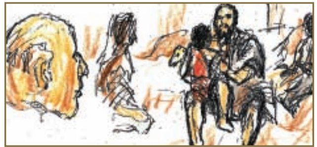
Yeshua puts his hand on the lamb. YESHUA (continuing) - "This is a very special lamb."