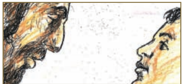
Yeshua regards Joel, closely. YESHUA - "Honor the Father..., for He loves you." Joel studies him intently. YESHUA (continuing) - "And remember Joel, for God nothing is impossible."